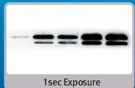
1 sec Exposure