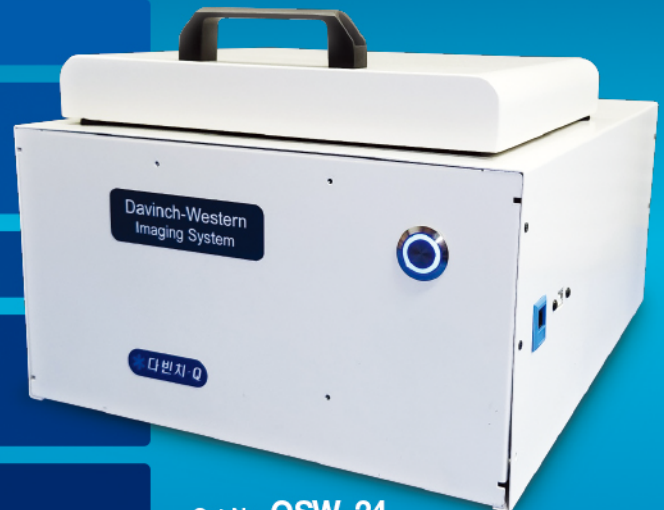
Cat No. OSW-24