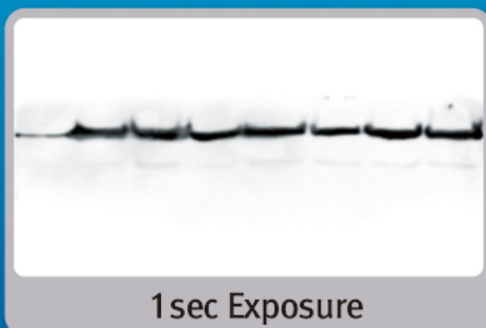
1 sec Exposure